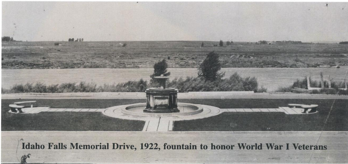
Idaho Falls Memorial Drive, 1922, fountain to honor World War I Veterans